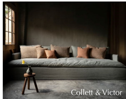
Collett & Victor

Founded in 1959, this manufacturer brings together East and West in its Italian-designed, contemporary rugs and carpets, each crafted through time-honoured techniques practised by the finest artisans of Nepal and Pakistan.